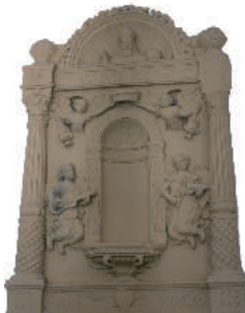
Main altar of Our Lady of Lourdes, Trofa, Águeda