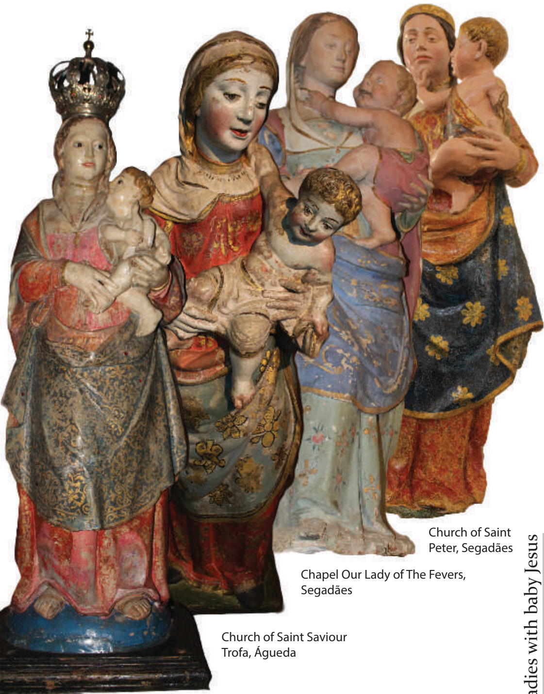
Chapel Our Lady of The Grace, Assequins