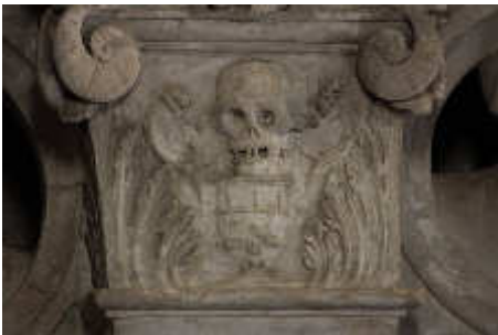
Capital pilaster between the tomb of D. Joana and D. Duarte