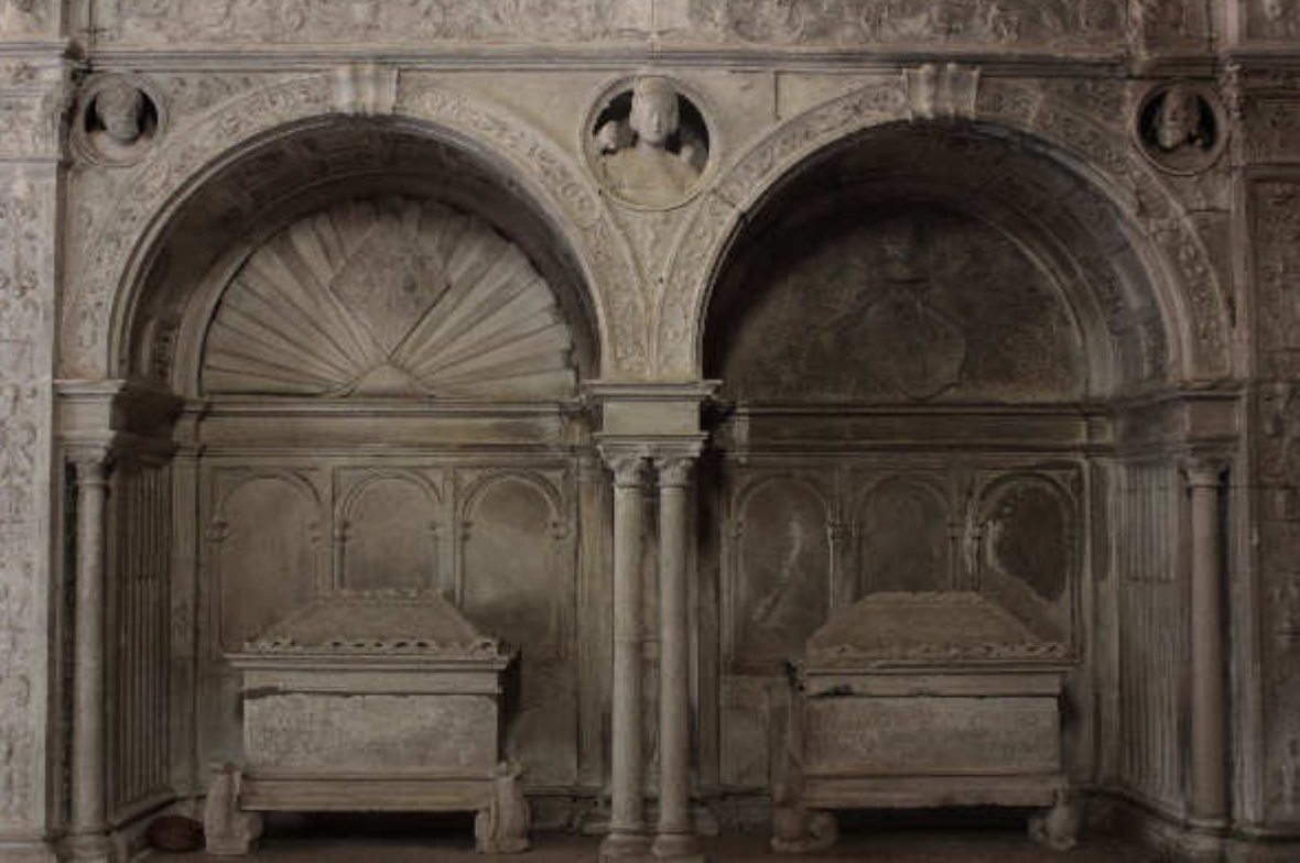
Arcosolium with polls, side of the gospel