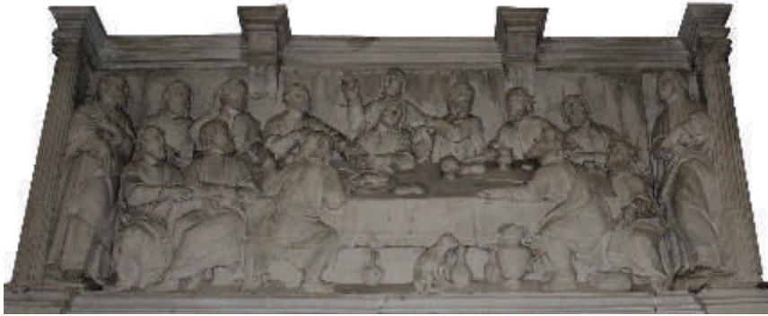
Altarpiece about Last Supper, Chapel of Blessed Sacrament (top) Saint Eulalia Church , Águeda