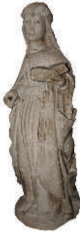
Image of Saint Eulalia Mother Church of Águeda