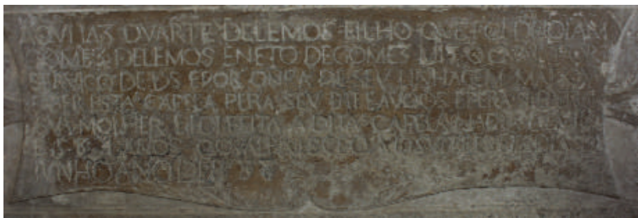
Tomb epitaph Duarte de Lemos, side of the epistle