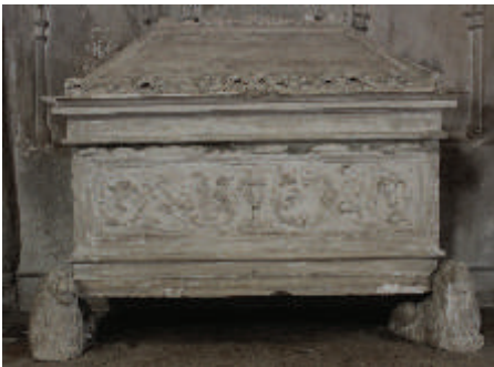
Urn without inscription on the tomb of D. Joana de Lemos