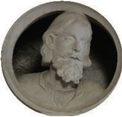
Medallion pediment on the tomb of D. Duarte de Lemos