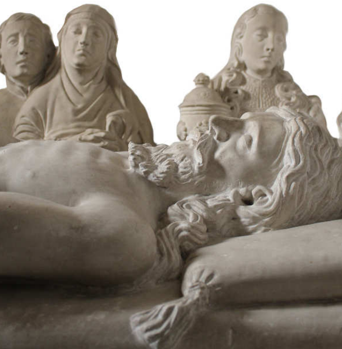
Detail of the sculptural group Deposition of Christ Mother Church of Águeda