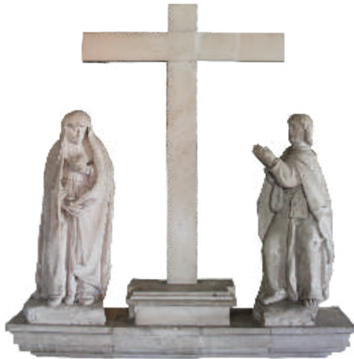
Calvary with Our Lady and Saint John Side entrance of Mother Church of Águeda