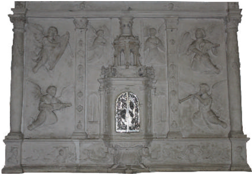
Altarpiece about Last Supper, Chapel of Blessed Sacrament Saint Eulalia, Águeda